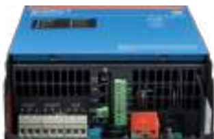
Connection Area MultiPlus-II 3k